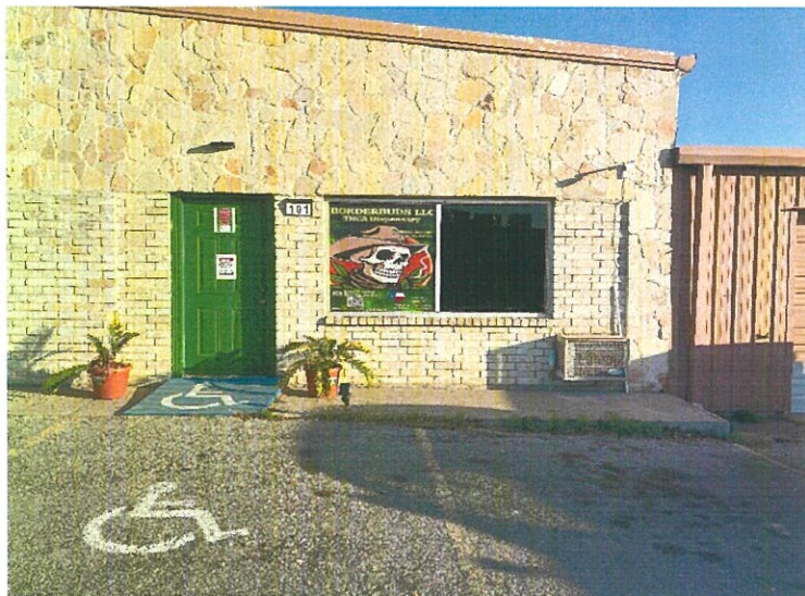
Borderbuds LLC 101 Kings Way Del Rio TX 78840