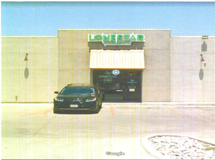
Lone Star Vitality 1101 Veterans Blvd, Suite 2 Del Rio TX 78840 29.37432 N-100.90153