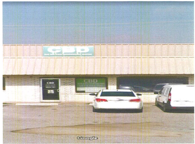
CBD Del-Rio Pain Management Center 306 Margaret Lane Del Rio TX 78840 29.39114 N-100.90919 W